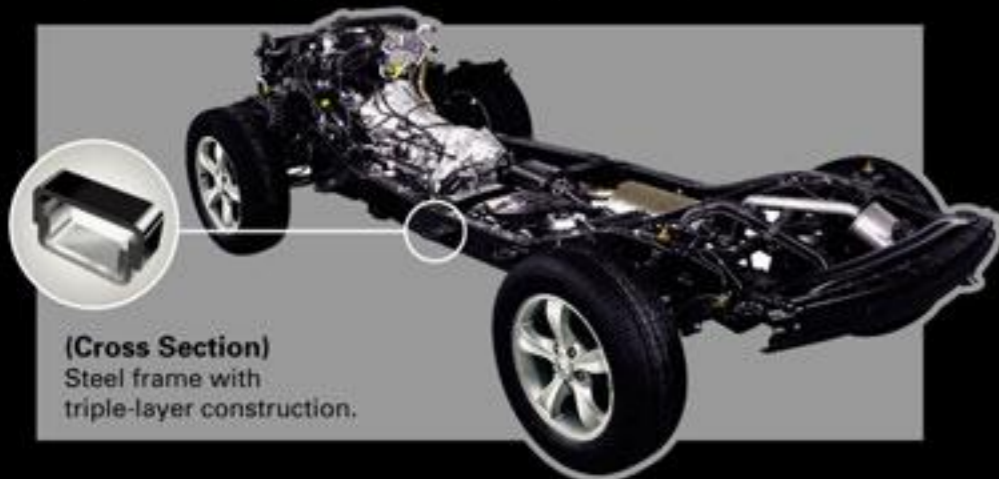
(Cross Section) Steel frame with triple-layer construction.

The ultra-rigid steel frame chassis with triple layer construction and the reinforced body have been designed to work in tandem to increase the overall rigidity and to form a fully integrated safety cell that is designed to optimise occupant safety.