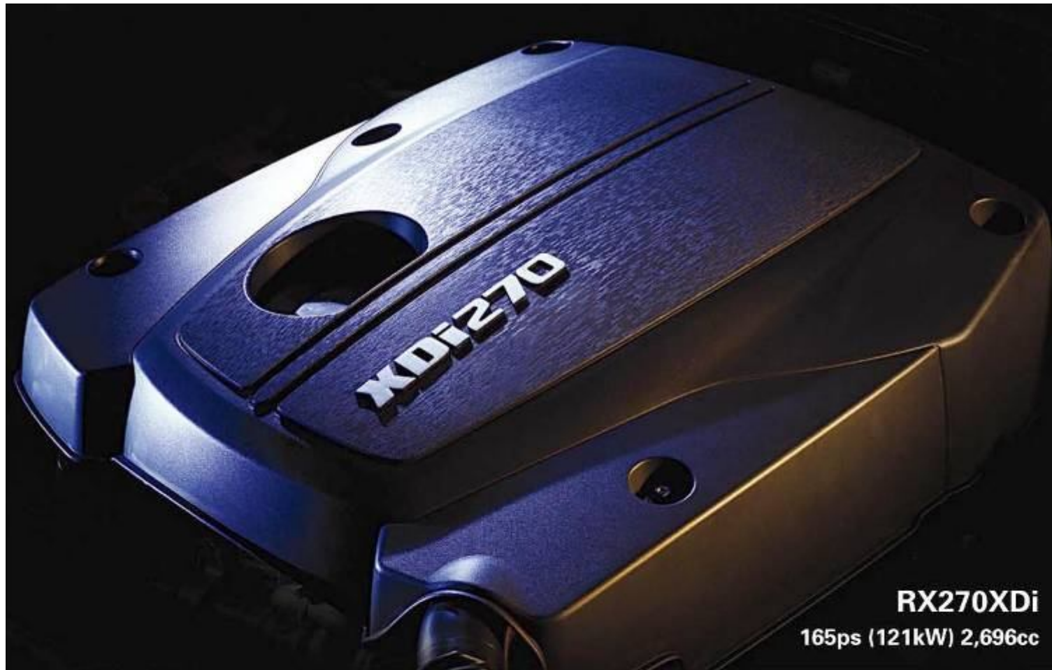
RX270XDi 165ps (121kW) 2,696cc