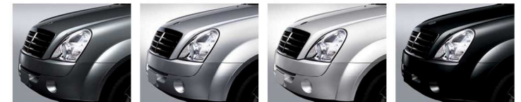
Cyber Grey (ACG)